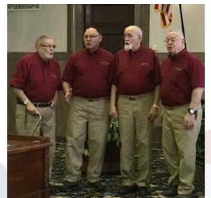
Webster Grange #436 Quartet welcomes the new citizens with song!