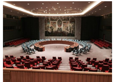
Security Council Chamber, United Nations Headquarters.

On an unseasonably warm and sunny December day, I joined 50 men and women from around New York state and Canada for "League Day" at the United Nations. League Day is a wonderful perk of being a LWV member because it entitles you, for a modest fee, to attend two UN briefings on current topics; these briefings are not open to the general public.