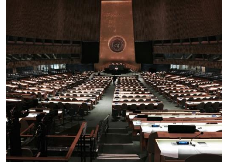
General Assembly Chamber, United Nations Headquarters.