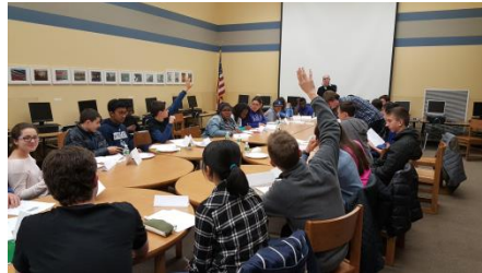
Youths from local high schools at this season's first meeting of "Tools for Change".

The Tools for Change Seminar welcomed a record number of students to its first meeting on December 7, 2015. Thirty-two students came from Blind Brook, Rye Neck, and Port Chester High Schools and represented a wide range of talents and perspectives from the community.