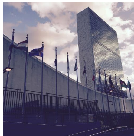
United Nations Headquarters, New York City.