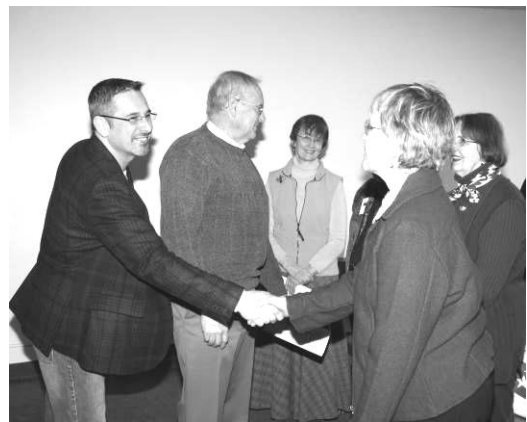
Rensselaer County Legislators greet League members

On the substantive side, we hold several informative meetings each year for the general public on issues -- such as redistricting, solid waste management and health care -- that have long been of concern to our members and the community at large. Finally, our website ( www.lwvrc.org ) contains a wealth of practical and substantive information with links to many governmental sites. (continued on page 4)